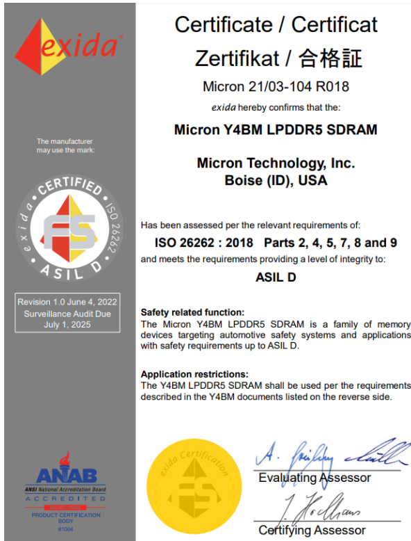
Figure 3: ASIL D Certificate Micron LPDDR5/5X DRAM

These are publicly available documents from exida, and Micron delivers the following safety related documents to its customers: