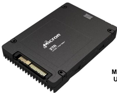
Micron XTR SSD U.3: 15mm

The result? The Micron XTR provides significantly better value than Intel Optane SSDs.