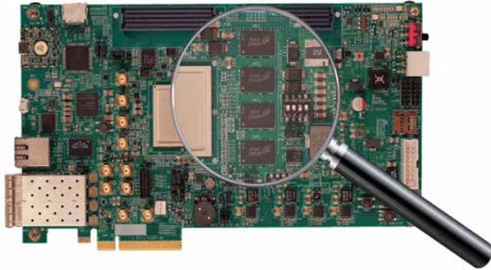
Sample Reference Board Demonstrating Micron's Device Compatibility with an FPGA

Contact a Micron sales representative today to discuss your memory options. We have a number of validated solutions—including serial and parallel NOR flash, SLC and MLC NAND flash, SSDs, e.MMC, DRAM, LPDRAM, DRAM modules and multichip packages—to help enable your next design innovation.