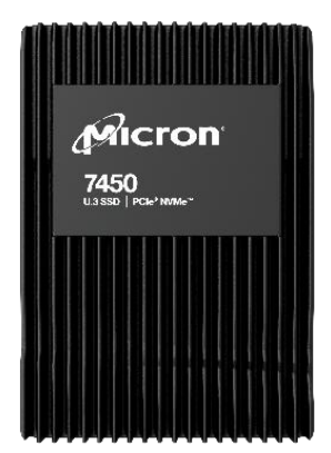
U.3: 7mm and 15mm

Designed as a mainstream solution, the 7450 SSD balances performance and density. Our offering includes a PCIe Gen4, M.2, 22 x 80mm with powerloss protection<sup>4</sup> and a 7.68TB E1.S that delivers industry-leading capacity.<sup>5</sup>