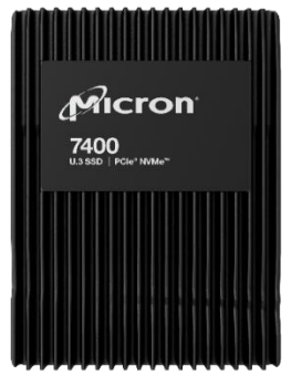
U.3: 7mm and 15mm

It is a flexible line of data center SSDs supporting standard server storage (U.3), cloud and 1U platforms (performance and density focused), and system boot (M.2).