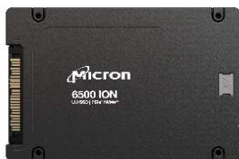
Micron 6500 ION 30.72TB SSD Available in U.3 (15mm) and E1.L (9.5mm)

For data centers that need to affordably scale storage density, the Micron 6500 ION is the answer.