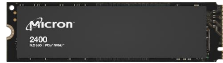
M.2 22x80mm 512GB, 1TB, 2TB